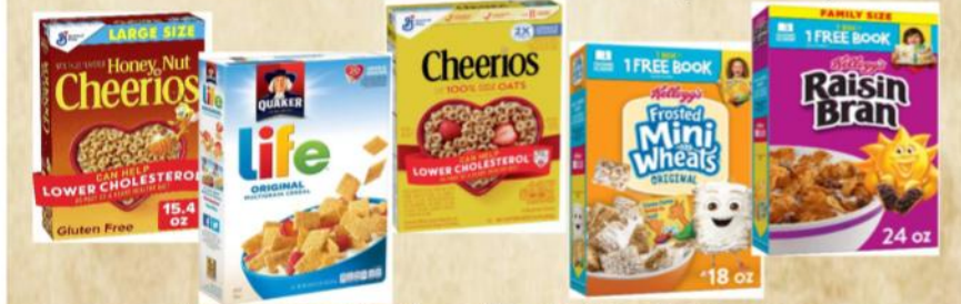
Please pray for those less fortunate than us

Place cereal boxes in the baskets located at the entrances of the churches of our parish: St.Adalbert, St.George, Mother of Divine Grace, and Nativity BVM. Donations can also be left at any rectory