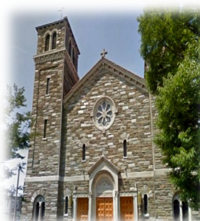
Mother of Divine Grace